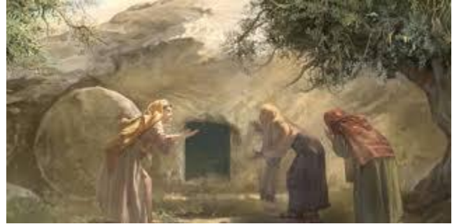
B). The Women at the Tomb