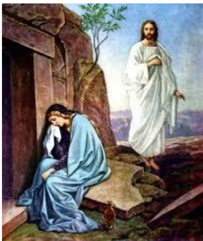
C). Jesus meeting with Mary Magdalene