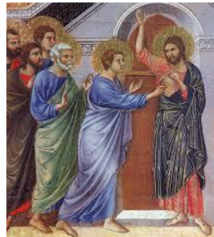
D). Jesus meeting with Thomas

If you answered A, B, and C you are correct, Jesus' encounter with Thomas occurred a week later.