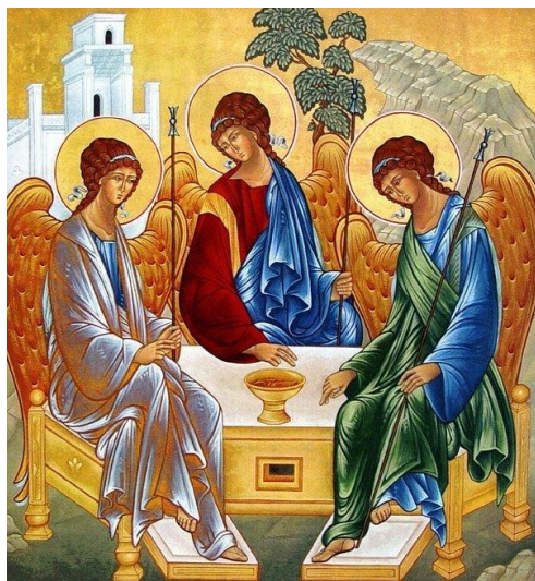
The Trinity -Icon by Andrei Rublev